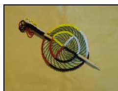
Sweet Grass Hair Piece