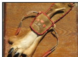
Deer Leg Knife Sheath