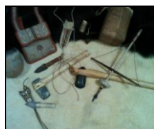
Primitive technology/Bow drill