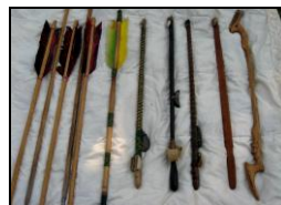
Atlatl and darts