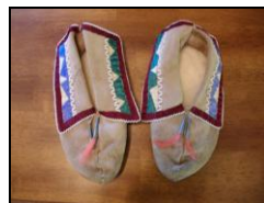
Center Seam Moccasins