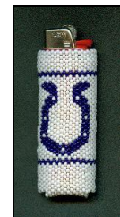
Peyote Beaded Lighter Case