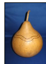
Children’s Class Gourd Container