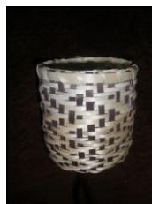
Black Ash Basket