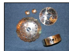
18 th Century Trade Silver